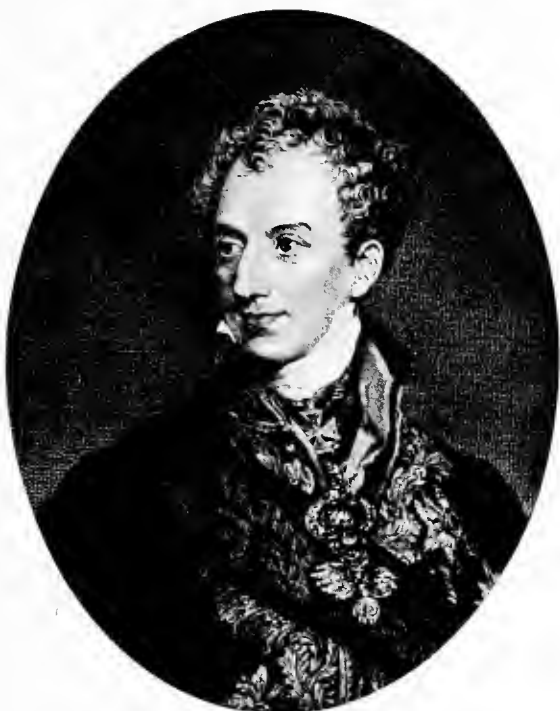
PRINCE CLEMENT METTERNICH, CHANCELLOR OF STATE